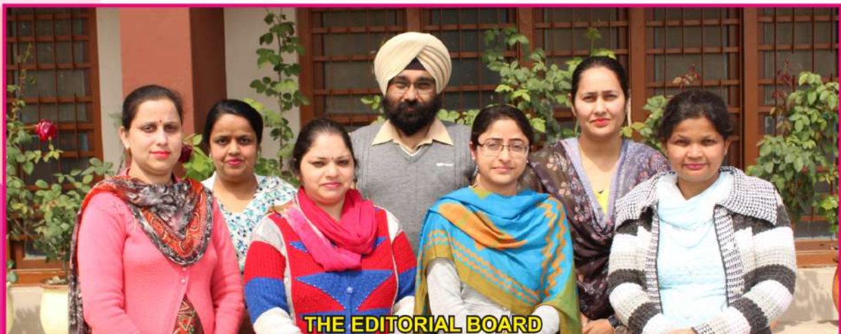
THE EDITORIAL BOARD

Swami Vivekananda quotes "Arise, awake and stop not till the goal is achieved". The school organized various events during the session 2019-20 so that the students could get the opportunity to showcase their hidden talents.